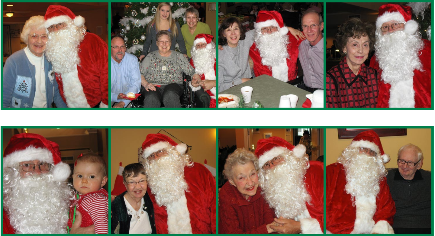
Santa Claus takes a break from making toys to visit with residents and guests.