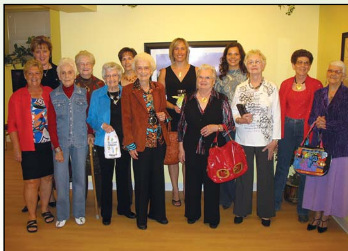
During the Ladies Luncheon and Style Show, residents and staff model fashions from Go Casual!, a local shop that sells women's clothing and jewelry.