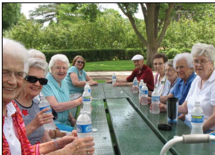
A group traveled to McKennan park and enjoyed the sunny, green-filled surroundings. The park is one of 70 public parks in Sioux Falls.