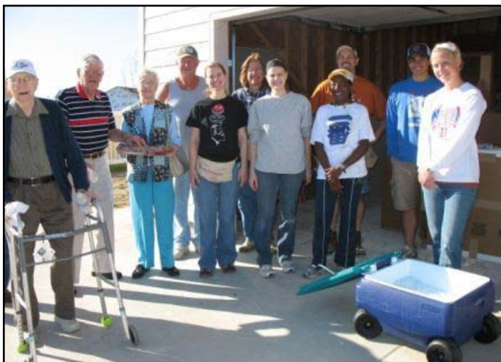
A group picture of residents and volunteers

The home will be completed this fall after many hours of volunteer work. ■