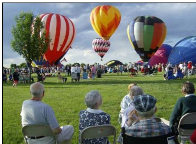
Residents watch hot air balloons take off from Kenny Anderson Park during the 33rd Great Plains Balloon Race.