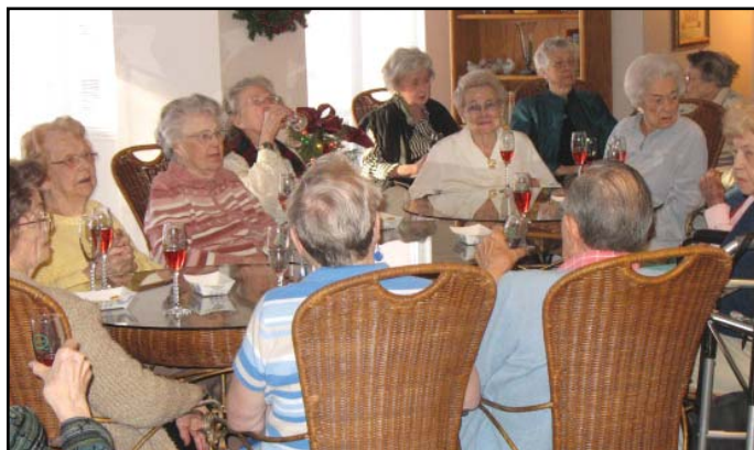
Waterford residents recently celebrated the New Year.