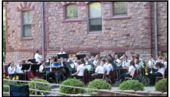
The Sioux Falls Municipal Band recently performed at Waterford.