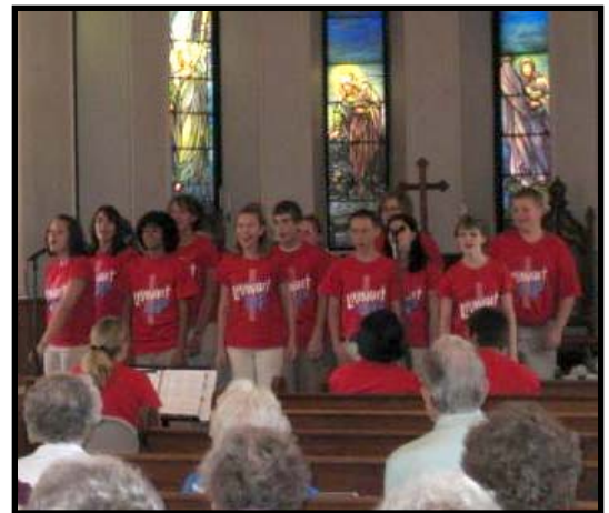
The Kansas City Youth Choir performs in the chapel.