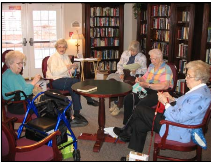
The Knit Wits gather and work on their knitting projects.